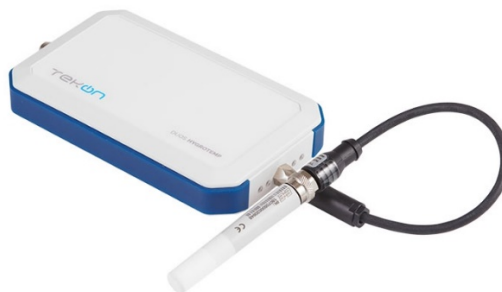
Figure 1 - DUOS HYGROTEMP with humidity and temperature probe

Because it deploys a standalone wireless network without dependence or external costs, the solution is not a fixed operating cost and is therefore free of charge for temperature and humidity communications. This makes it possible to install the different temperature and humidity sensors within minutes without interference with local infrastructures.