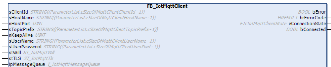
Figure 2 - FB_lotMqttClient function

The FB_lotMqttClient function block has in its structure a set of inputs, outputs and methods required for the connection and communication with the MQTT broker.